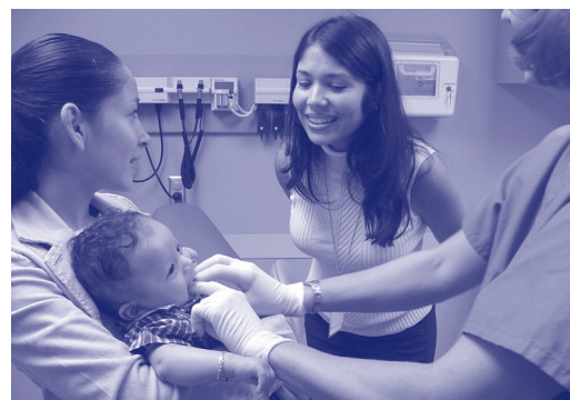
Greater Twin Cities United Way Bright Smiles Program

Early childhood caries (ECC) is an infectious disease. The bacterium Streptococcus mutans is transmitted from the saliva of mothers or other primary caregivers during close, personal contact, such as kissing a baby. 1 ECC can begin at any point after teeth erupt, progresses rapidly, and can have a lasting impact not only on oral health but on children's overall health, leading to problems with speech and communication, nutrition, pro-